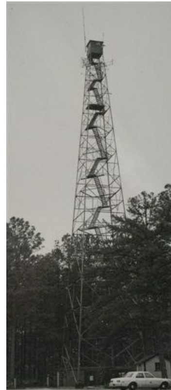
Woodworth Tower, Alexandria Forest, LA. 176'

Woodworth Fire Tower, near Alexandria, Louisiana is a 176' tall iron MC-40 by Aermotor Co. It is the tallest active lookout in North America. Hundreds of Aermotor towers between 99' and 123' tall once stood across America. A few of them are still staffed.