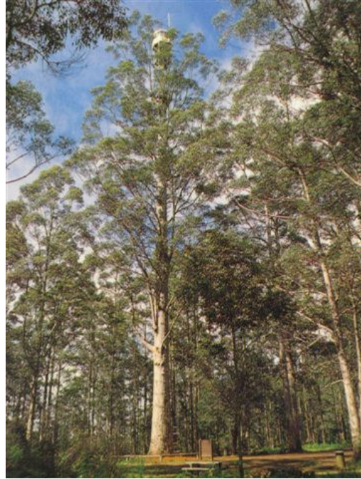
Gloucester Tree LO, Australia 200'

Western Australia is also home to the tallest and arguably the most incredible of all lookouts. Diamond Tree (191'), Gloucester Tree (200'), and the Warren Bi-Centennial Tree (225.6'), all near Pemberton, have towers with cabs erected atop huge karri eucalyptus trees. Each is accessed only by step pegs driven into the tree. Warren, the tallest, is staffed yet today.