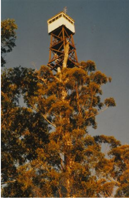
Diamond LO Tree, Australia 191'