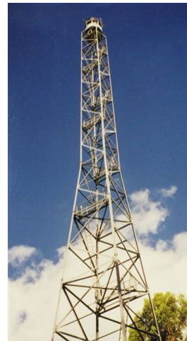
Beard LO, Western Australia. 200'

The tallest metal lookout structure in the world is the 200' Beard Tower, a few km east of Pemberton, Western Australia.