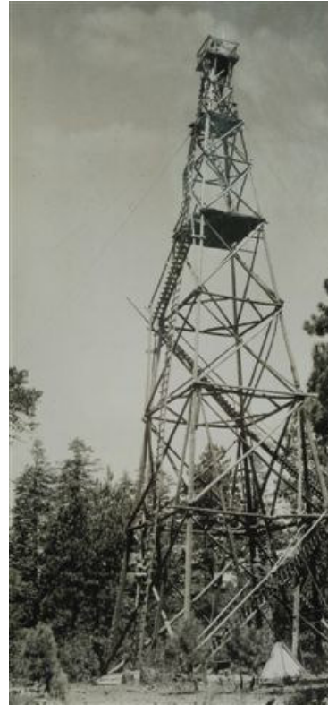
Promontory Pt. LO, AZ 1924 tallest pole tower 121'

Perhaps the crudest and scariest fire tower ever, was at Promontory Point in central Arizona's Sitgreaves Nat'l Forest. Built by splicing small poles together to create a rickety platform 121' tall, it served its purpose from 1913 until 1923, and was the tallest firewatcher's perch in the nation during its time.