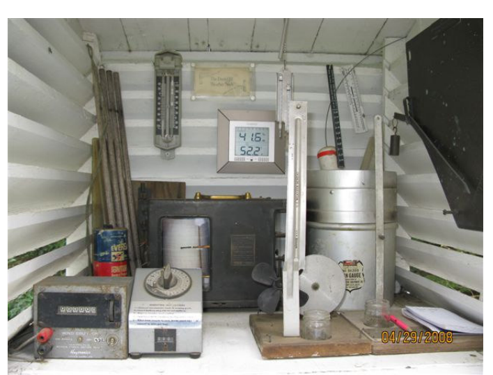
Inside Stevensen Weather Box

Each day at 1:00pm, it was the lookout's job to gather eight weather components: current wind speed & direction; precipitation the past 24 hours; fuel moisture in 1/2" wooden sticks precisely weighed in grams; relative humidity obtained by reading the current temperature on the psychrometer (two thermometers, one dry, one wet); and the state of weather (cloud %, type, raining?, lightning?). Some lookout stations even had a hygrothermograph (time clock measuring the 24-hour high and low temperature and humidity).