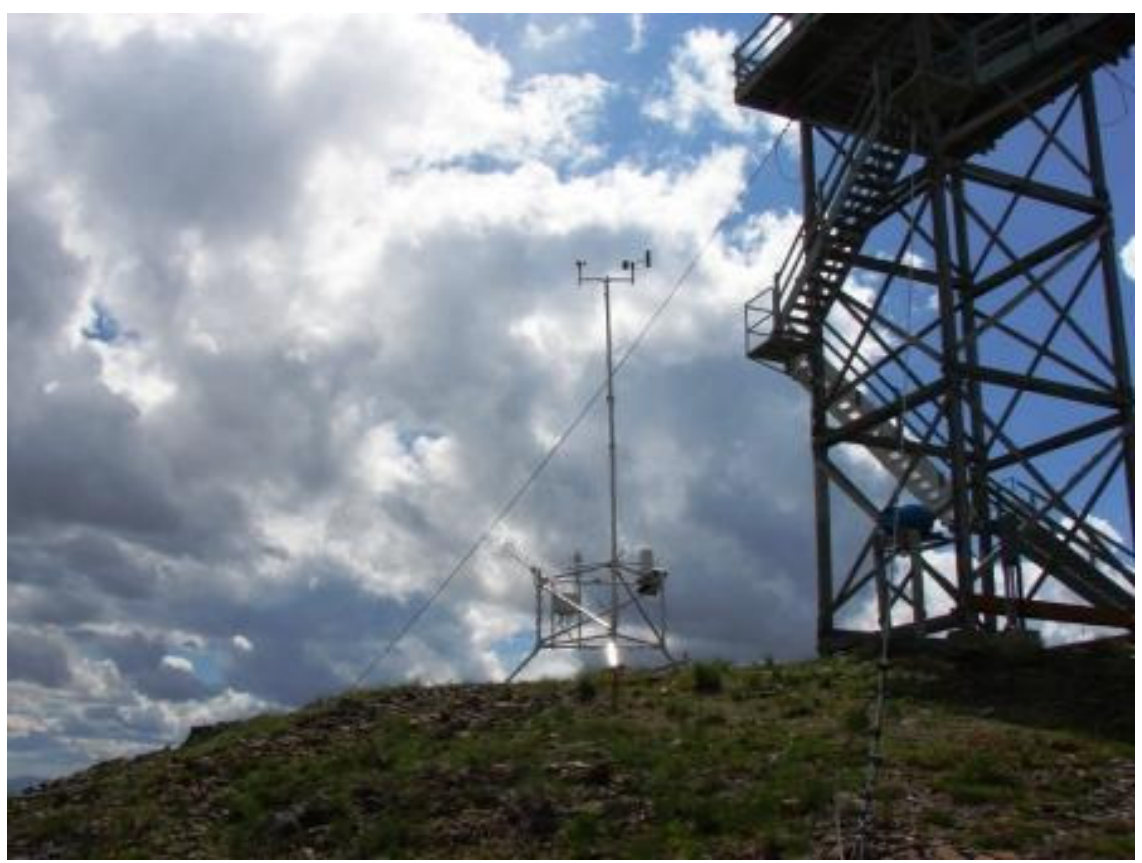
Modern RAWS Station

Then, as could be predicted, the on-site lookout weather observer soon became all but obsolete, when Remote Automated Weather Stations (RAWS) were introduced in 1978. Now, all one needs is a key pad on the radio, or a cell phone, to dial up a number and get the current and predicted weather in more detail than anyone cares to know.