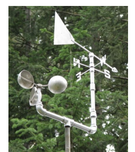
Anemometer & Wind Vane

Each day at 1:00pm, it was the lookout's job to gather eight weather components: current wind speed & direction; precipitation the past 24 hours; fuel moisture in 1/2" wooden sticks precisely weighed in grams; relative humidity obtained by reading the current temperature on the psychrometer (two thermometers, one dry, one wet); and the state of weather (cloud %, type, raining?, lightning?). Some lookout stations even had a hygrothermograph (time clock measuring the 24-hour high and low temperature and humidity).