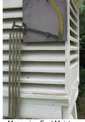
Fuel Moisture Sticks