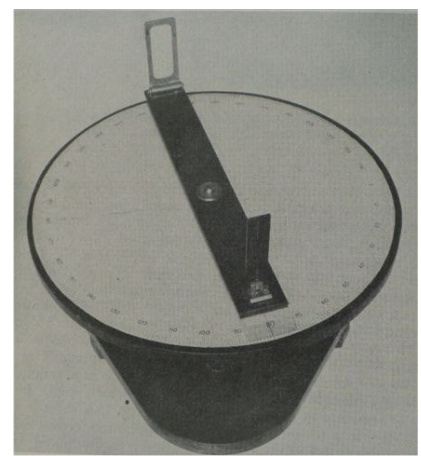
1949 Minnesota Fire Finder