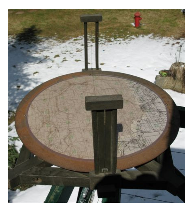
Wash Div For AWS Firefinder 1942

With the War years of 1942-1945 came some thrifty non-metal firefinder alidades, as Aircraft Warning Service (AWS) lookouts were established to watch for enemy aircraft along our coastal states. In 1942, the Washington state Division of Forestry came up with one made entirely of wood.