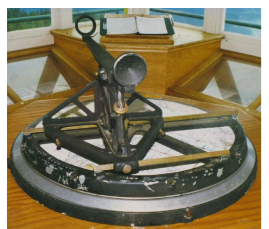
British Columbia Firefinder