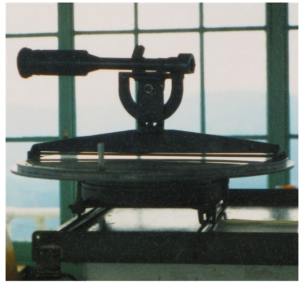
1980s Boise NF Fire Finder