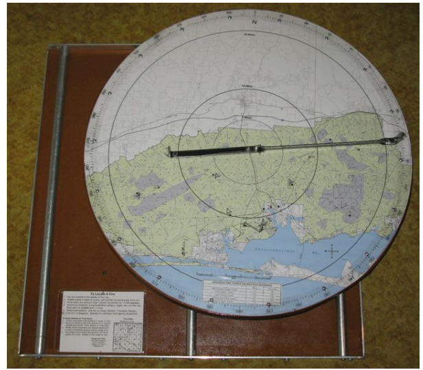
Kresek Fire Finder - extended sight arm option