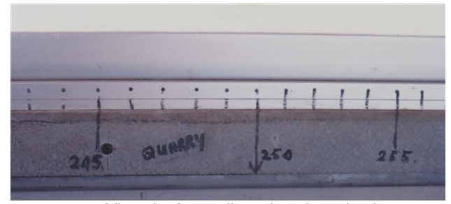
1990s Victoria Australia azimuth etched on windowsills

One might say, almost as good, and certainly the least expensive at 10 cents, is used yet today in Australia... a string hanging from the ceiling, precisely above the center of the room, with pencil marks, 0 to 360, around the windows.