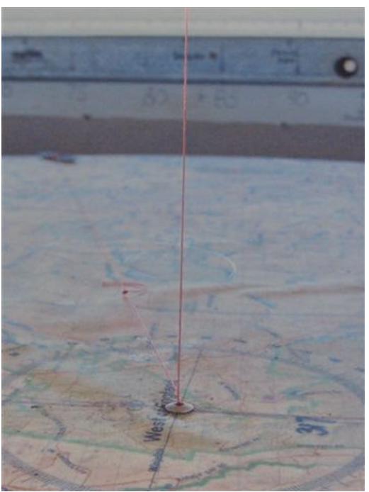
1990s Victoria Australia string Fire Finder

One might say, almost as good, and certainly the least expensive at 10 cents, is used yet today in Australia... a string hanging from the ceiling, precisely above the center of the room, with pencil marks, 0 to 360, around the windows.