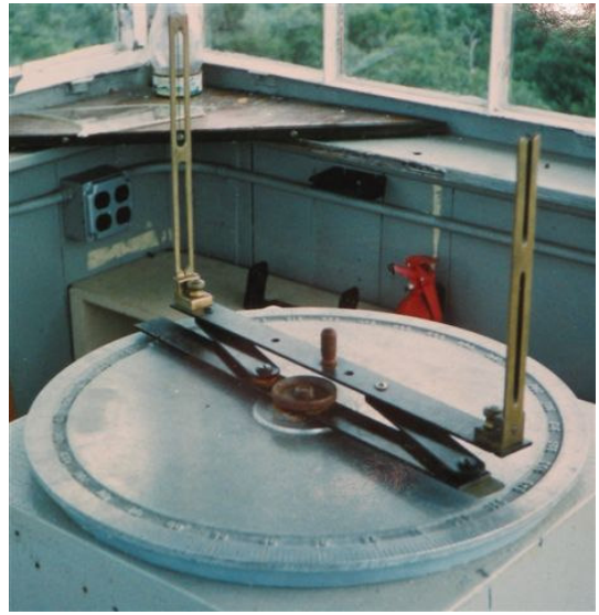
1990s New Jersey Bearfort Fire Finder